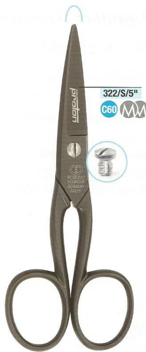
322/S/5'' C60 MM