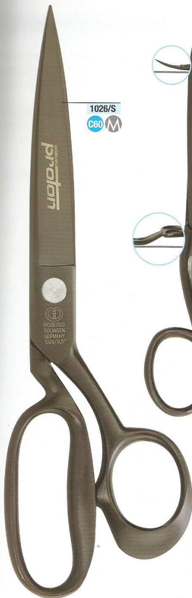
1026/S C60 M