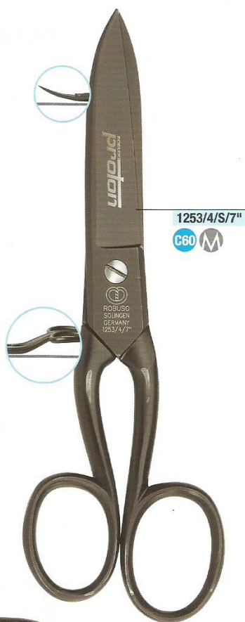
1253/4/S/7'' C60 M