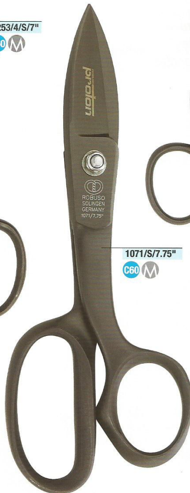
1071/S/7.75'' C60 M