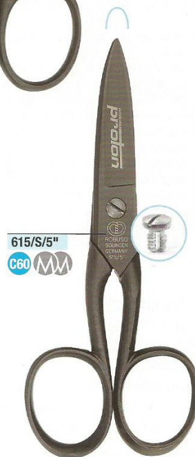
615/S/5'' C60 MM